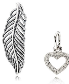
Combine with a beautiful PENDANT...