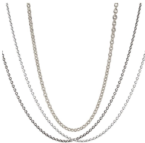
Choose your favourite CHAIN