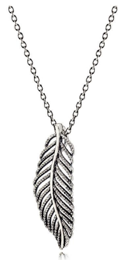
...to create your own NECKLACE